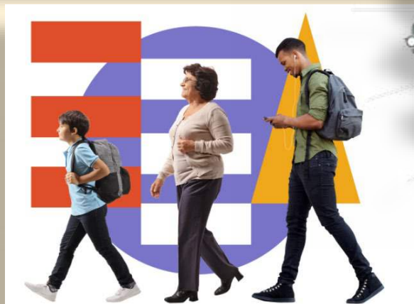
European Education Area