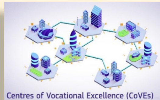
Centres of Vocational Excellence (CoVEs)

https://ec.europa.eu/info/funding-tenders/opportunities/portal/screen/opportunities/topic-details/erasmus-edu-2023-pex-cove