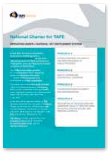
National Charter for TAFE flyer

The National Charter was developed after an exhaustive process of consultation; liaison took place with the Board of Skills Australia, the industry liaison committee of the COAG Standing Council on Tertiary Education, Skills and Employment (SCOTESE) Ministers, business leadership, the TAFE sector itself, along with many federal government officials and state and territory training agencies. TDA argued that key principles which formed the basis of a National Charter would be important for informing the COAG SCOTESE.