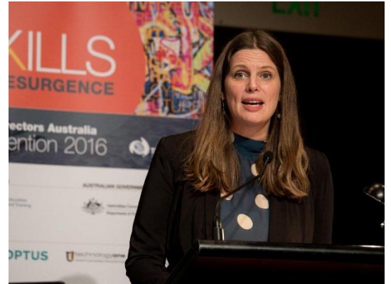
The Hon. Kate Ellis Shadow Minister for TAFE and Vocational Education