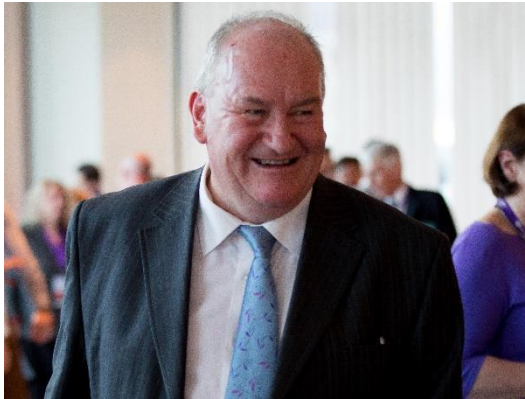
The Hon. Steve Herbert Victorian Minister for Training, Skills and International Education