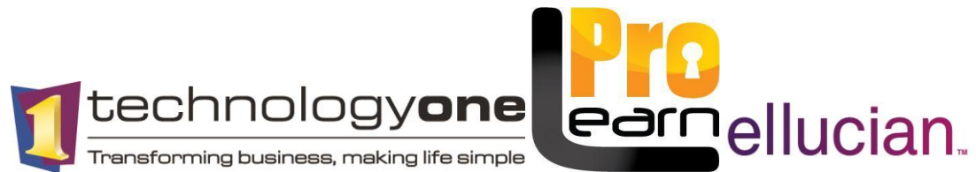
Image: Technologyone, ProLearn and Ellucian logos

Having corporate affiliates of this calibre demonstrates that TDA has strategic partnerships with industry bodies supporting the education sector.